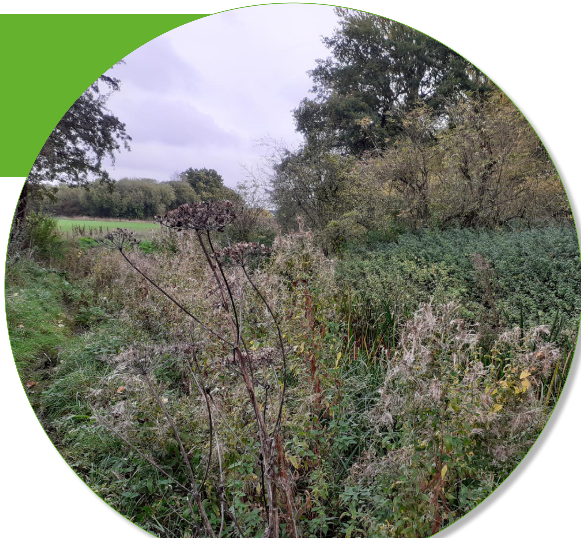
BEFORE: NATURAL EMBANKMENT IN COLLAPSED STATE

The 100% recycled and recyclable Flex MSE system consists of earth and sand filled ‘geobags’ with joining plates, and layers of geogrid and structural fill behind the bagged facing. It is designed to outlast materials such as concrete and steel. The geobags and interlocking plates adapt and move with the land, giving it the capability to endure events that would destroy traditional wall systems. Installation takes nearly half the time and cost of most other walls, with only 3% of the carbon.